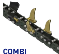
COMBI Mixed terrain