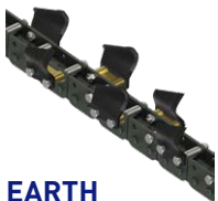
EARTH Soft ground