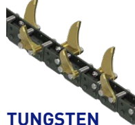
TUNGSTEN Hard ground / Frozen