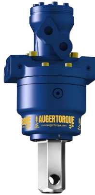
Earth Drill Drive Unit ML 1100-13