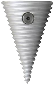
Log Splitter Pilot